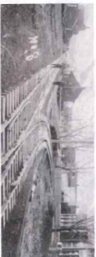
Chili Line at Española Depot

A monthly meeting is held the first Wednesday of each month at 10:30 a.m. at the Bond House Museum.