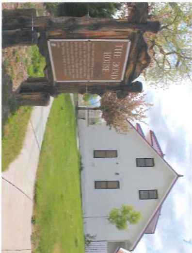
The Bond House Museum